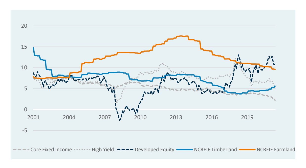
FIGURE 3: TIMBERLAND & AGRICULTURE PERFORMANCE (10YR ROLLING)

These figures are based on industry standard benchmarks for each asset class from the National Council of Real Estate Investment Fiduciaries' (NCREIF). Descriptions of each are provided at the end of this section.